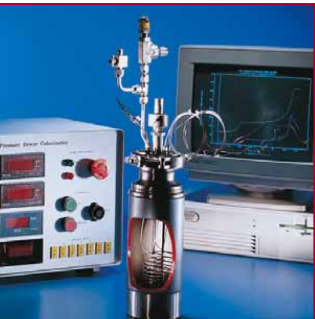
Chilworth Technology Adiabatic Dewar Calorimeter.