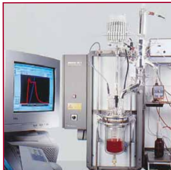
Mettler RC1 Calorimeter.